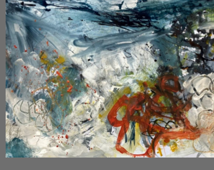
Workshop 2 - Moving your work on