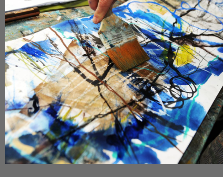
Workshop 1 - the Foundation

If you're unsure which workshop is right for you just get in touch and we can chat about what option is best for you.